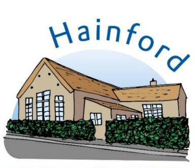
VC PRIMARY SCHOOL

Hainford VC Primary School Hope, Compassion & Responsibility