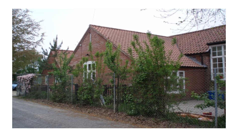
Dropping off and collecting children

Hainford Primary School is a small village school situated in the centre of the village which is north of Norwich. The school currently caters for pupils aged 4-11 and has existed since the 1870's. The school serves the villages of Hainford and Stratton Strawless. Many educational and social changes have taken place in this time and Hainford Primary School has always responded to the challenges of meeting children's educational needs in a positive and constructive way. The school is a Church of England Voluntary Controlled school with close links to the Church and a strong Christian ethos.