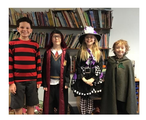
Crime Solving in English